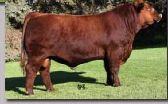
Sire - Red Ter-Ron Real Deal

EPD's | BW +3.4 | WW +37 | YW +69 | Milk +12