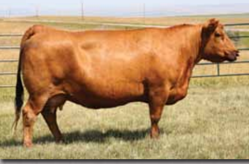
Dam - Red FL Fayette 33M

EPD's | BW -2.6 | WW +51 | YW +75 | Milk +22