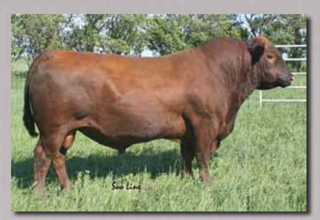
Cash - Sire of Lots 17 - 19