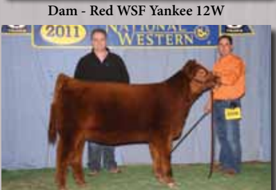
Paternal sib, sold to Wildcat Creek, Kansas