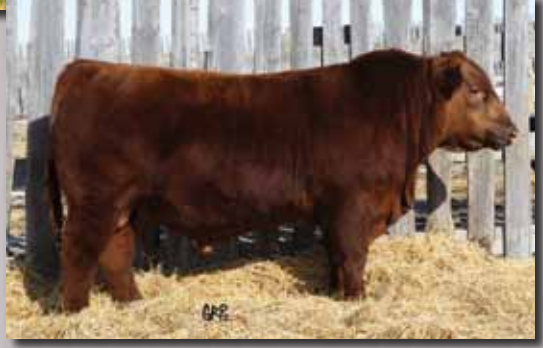
Maternal brother sold to South View Ranch

EPD's | BW -0.2 | WW +38 | YW +59 | Milk +22