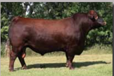
Sire - Red Ter-Ron Reload 703T