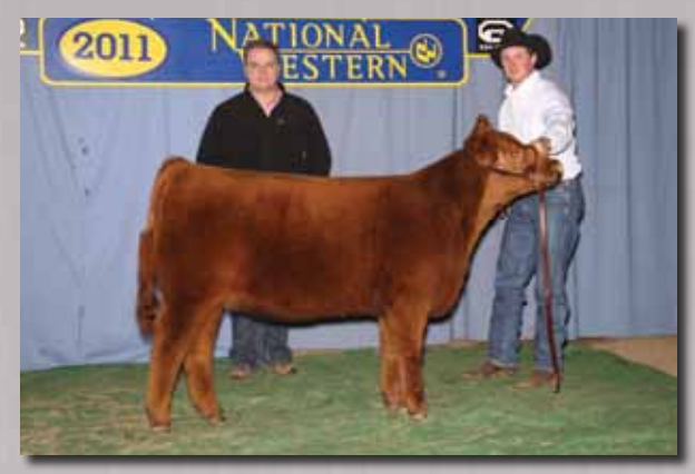
Paternal sib to Lot 16

JACKPOT! Have a good look at the pedigree, and then look at the EPD's. That will be enough to catch your attention but I think the best part is when you see the heifer with your own eyes.