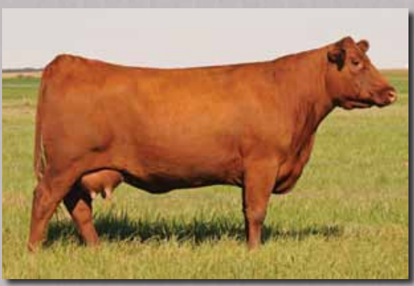
Dam of Lot 34