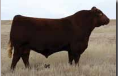
Sire of Lot 37 - Red Howe Bold Edition 80T

The dam Kapi 109R has been in our donor pen for a few years and has produced multiple bulls for our bull sale and also females in two of our female sales. Kapi 2Z is a super long spined, deep sided heifer that will make a great cow. She will be easy to find on October 14th.