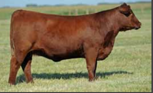
Daughter of Birdie by Cash sold in last year's sale to TC Reds - Wisconsin

EPD's | BW -0.4 | WW +53 | YW +73 | Milk +16