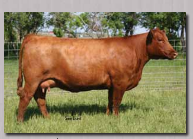
Dam of Lots 10 & 11 - Countess 6409

Exposed to Red Wheel Gangster 31Y June 15 - Aug 15