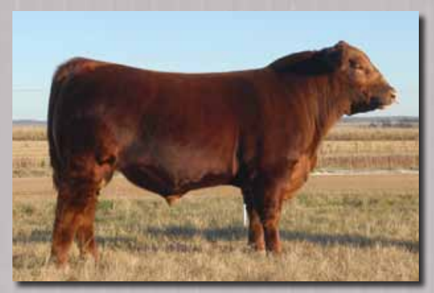
Hamley - Service Sire to Lots 17 - 19