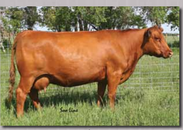
Dam of Lot 17

Countess 225Y is a rare opportunity to buy Red Corner Creek Cash offspring as semen on Cash continues to be very limited and is now off the market again until 2014. As you can tell from the picture, the dam, 314L is a beautiful cow that we purchased from the SooLine dispersal.