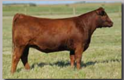
Maternal sib to Lot 20