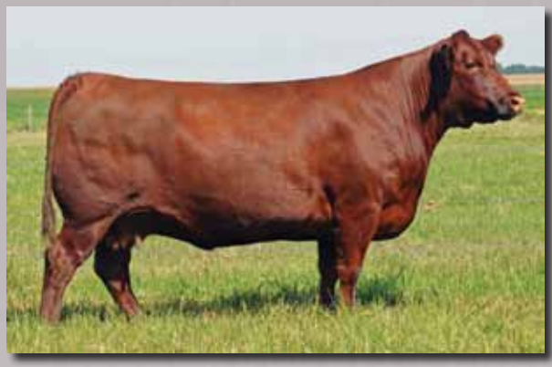
Dam of Lot 40

Cherry red and that cow look. Sandy 31Z comes off the Sandy 63S donor that was purchased in our Genetics in Motion 2011 sale by Rust Mountain View Ranch in North Dakota. I have a soft spot for this heifer and think she will be a fantastic cow.