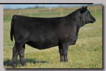
Full sister sold in 2011 Genetics in Motion Sale