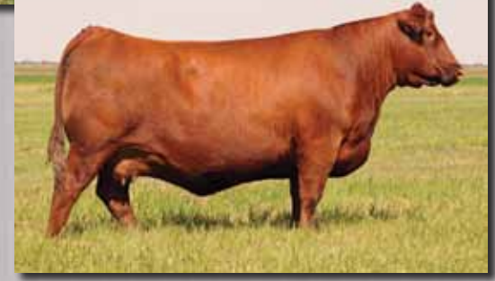
Dam of Lots 31 & 32 - Jasmin 48R

S | BW +3.4 | WW +37 | YW +69 | Milk +12