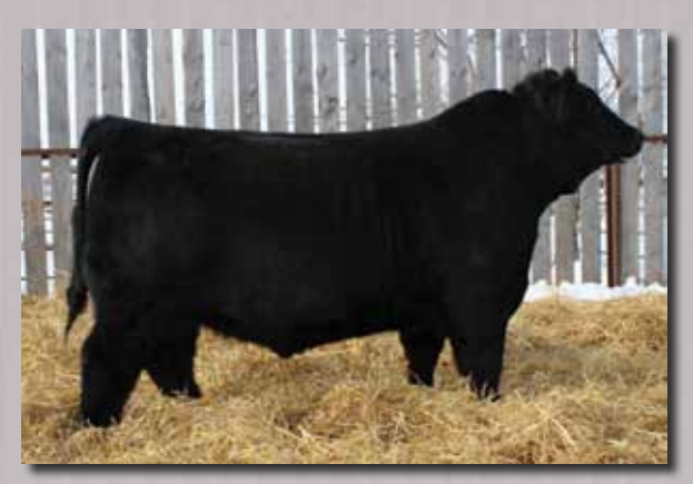
Sire of Lot 49 - Carruthers Game Day 18X

We are very proud to offer genetics off the outcross WAF Zorzal 321U herdsire. The Oakleaf 307Z heifer comes off a gorgeous cow we purchased from the Lookout Stock Farms sale last fall and we think she will have a number of friends on sale day. She is a super feminine heifer with a ton of future. Think about how she will improve your program.