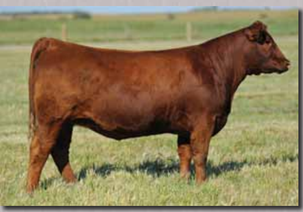
Paternal Sib to Lot 33

Kargo is doing a fantastic job for us and will be our dominant sire in our show string for Agribition and Denver. This late March Pricilla 44Z heifer needs a halter and a younger 4-H member. She is super cool, hairy and has a great temperament.