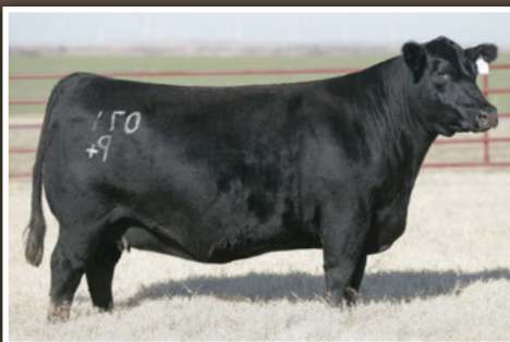
DUFF 927K JUANADA 071