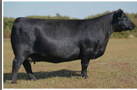
DWS BC FOREVER LADY 986