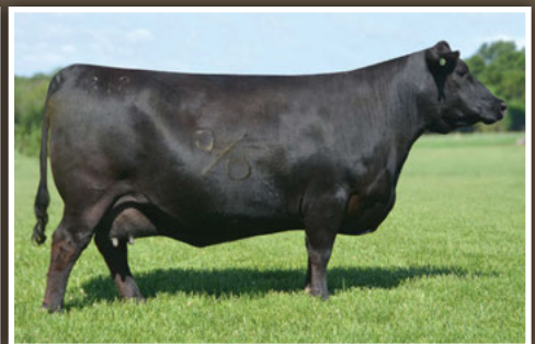
COLEMAN DONNA 812