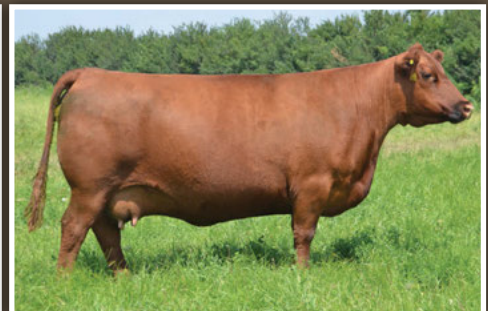
RED JCC ROXIE 20S