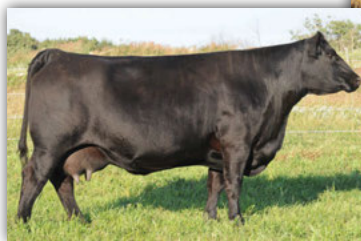
MVF May 183P Grand Dam of Lot 18