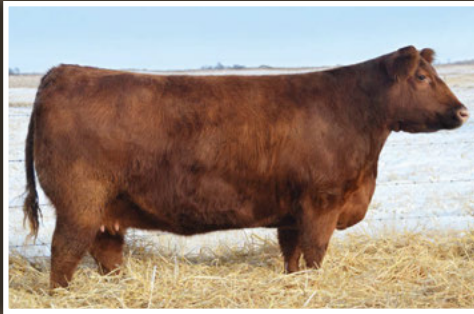
RED BRYLOR BONITA 204T