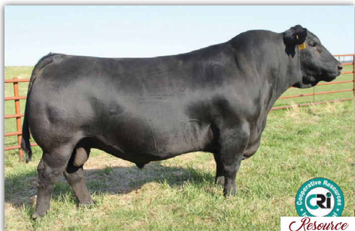
S A V Resource 1441 Reference Sire of Lots 3 & 4