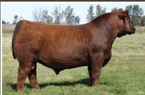
HXC HOT SHOT 44248