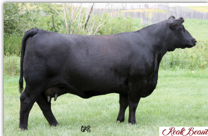
Six Mile Real Beauty 803U Reference Dam of Lot 27