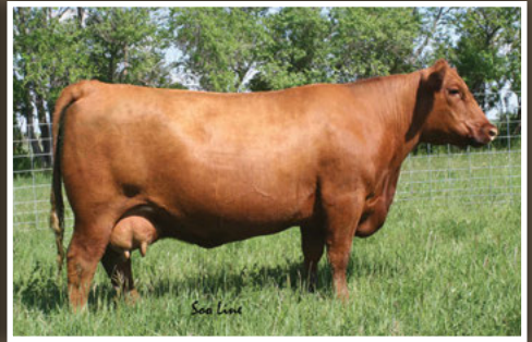
RED SOO LINE RHONDA 5109