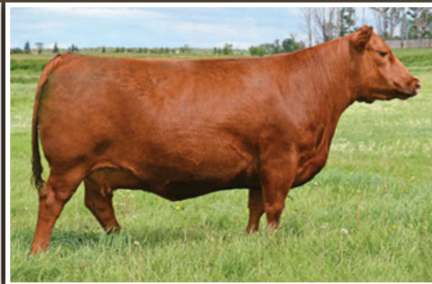
RED BRYLOR PRISCILLA 67W