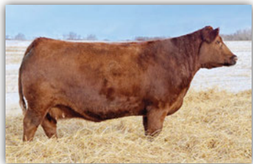
Red Southlans Mabel 36S Reference Dam to Lot 55