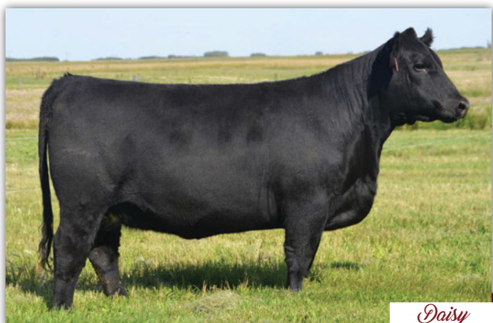
Blair's Daisy 321A Reference Dam of Lot 5