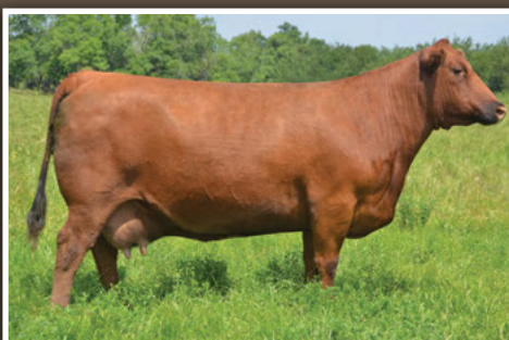
RED TOWAW DARLINE 15R