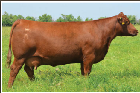
RED TOWAW COPPER LADY 8T