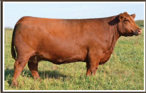
RED WIL BAR LANA 688S