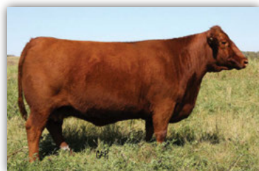
Red Bakers Faith 8L Reference Dam to Lot 79