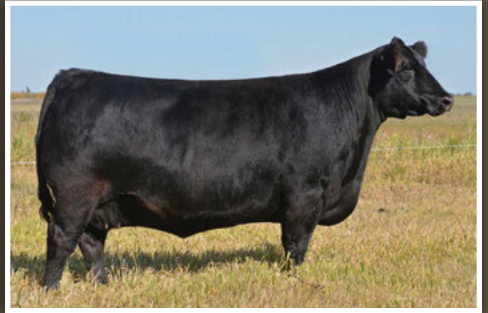
EXAR RUBY 0067