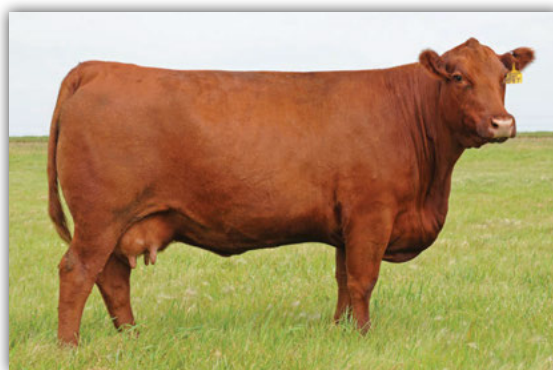
Red Soo Line Birdie 7034 Reference Grand Dam to Lot 57

BBC 33C 07 Apr 2015 1881354 BW: 89 AWW: 827