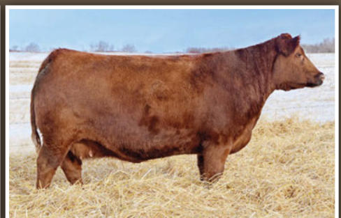
RED SOUTHLANDS MABEL 36S