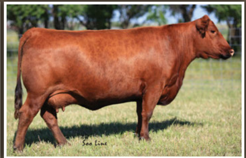
RED SOO LINE BANEBERRY 5238