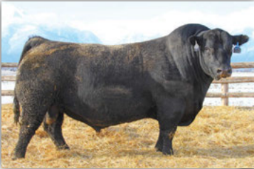
Coleman Charlo 0256 Reference Sire of Lots 1 & 2