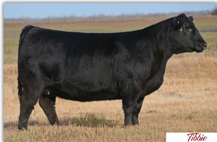
BBC Tibbie 444A Maternal Sister to Lot 24

BBC 401C 02 May 2015 1881422 BW: 82 AWW: 758