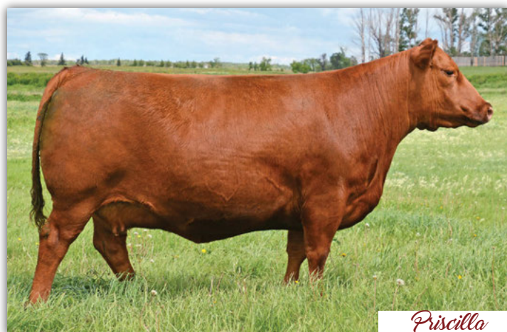
Priscilla Red Brylor Priscilla 67W Reference Dam to Lot 52