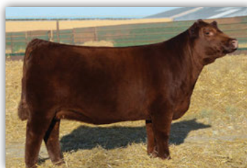
Priscilla 44Z Full Sister to Lot 52