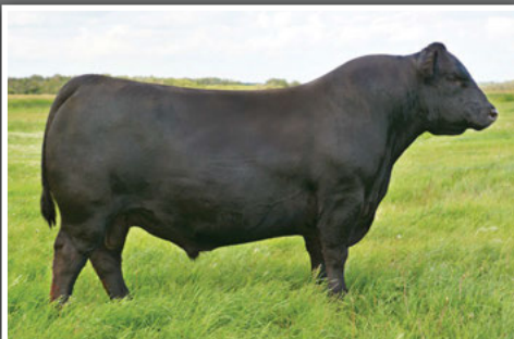
OSU FINAL EXAM