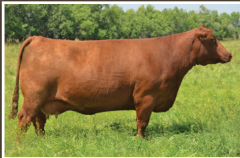
RED TIDE MARTINI 25W