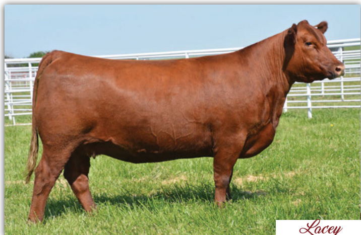
Lacey Red RCRA Lacey 3Z Reference Dam to Lot 74