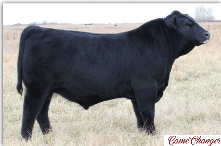
GameChanger BNC Game Changer 1Y Reference Sire of Lots 17 - 26