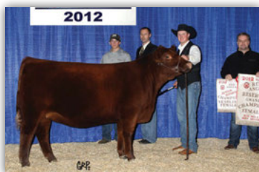
Full Sister to Lot 79

BBC 2C Twin 01 Mar 2015 1881306 BW: 78 AWW: 648