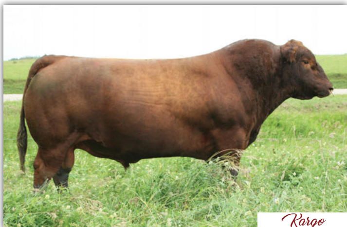
Kargo Red Ringstead Kargo 215U Reference Sire of Lots 47 - 52