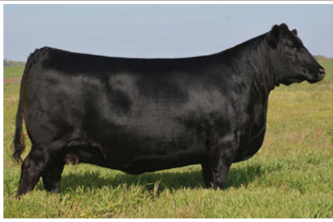
BARBARA OF PEAK DOT 505S