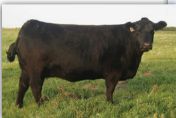
Double AA Bella 31'05 Reference Dam to Lot 7 & 8