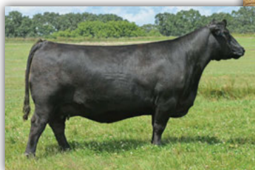
Blackbird 107X Maternal Sister to Lot 17