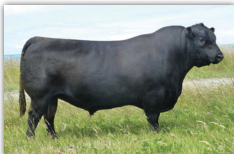
TE Mania Quantum 09 490 Reference Sire

Blair's Quantum 579C is a unique breeding piece. His sire is the Te Mania Quantum bull we found in New Zealand. We were impressed with his foot, performance and fleshing ability. The dam Yankee 12W is the most famous donor in our Red Angus program and is destined to be one of the most influential females in the history of the Red Angus breed. This outcross combination puts it all together and the future could be very interesting. A full sib sold in our last year's sale to Seth Cargo ND. Set your program apart and make a decision to lead the Red Angus breed forward.