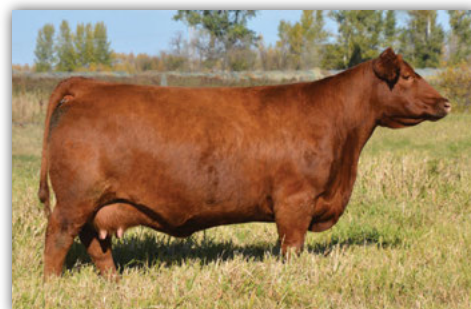
Red WSF Ms Yankee 13T 12W Reference Dam of Lot 45