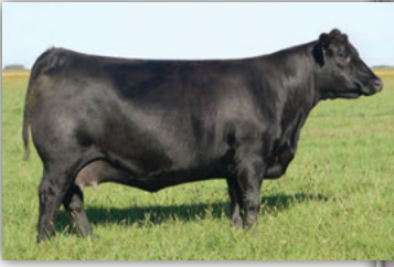
RSKY 6540 Ms Instinct 0065 Reference Dam of Lot 1

The Coleman Charlo calves at S A V took the beef industry by storm in February. We are excited to start our offering with two Charlo sons from powerful black donors in our embryo program. The Duff 0065 donor is owned with Bohrsen Marketing and we are very excited about her future. 790C has the same rib shape and presence as his sire. He is sound as a cat and deserves your attention on sale day.