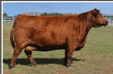
RED WILBAR CORA 443P