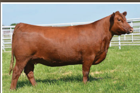
RED RCRA LACEY 3Z