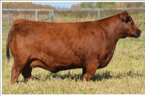
RED SSS JESSIE 261Z