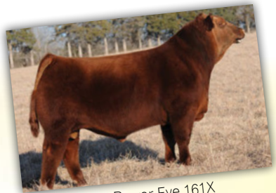
Red Soo Line Power Eye 161X Reference Sire