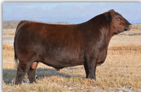
Red Six Mile Signature 295B Reference Sire of Lot 46