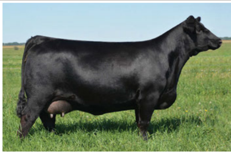
BAR-E-L ERICA 74A