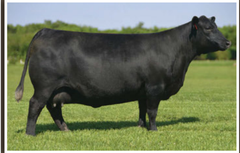
S A V MADAME PRIDE 0151