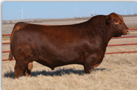
Blair's Bingo 581B Maternal Brother to Lot 45