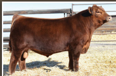
RED WRIGHTS 832S IRON HIDE 4Z