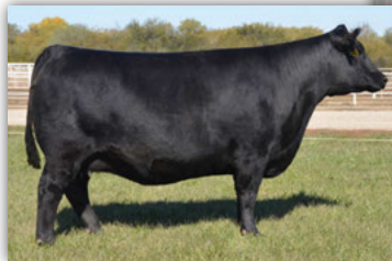
RAB Ms Final Answer 4955W Reference Dam of Lot 2 & 3

The donor dam to this powerful Charlo son is none other than the Mega Lass 4955W. We have combined the best of the best in this genetic mating and we can't wait for your feedback on sale day. Soggy and stout says it all. RETAINING 50% SEMEN INTEREST.