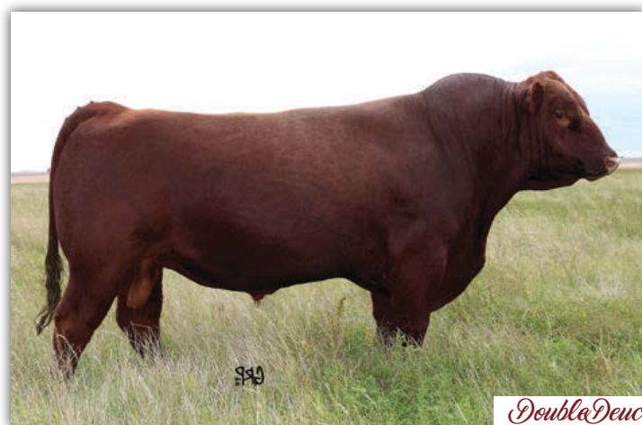
Red Bar-E-L Double Deuce 198Y Reference Sire to Lots 66 - 68

This group of Double Deuce bulls will definitely catch your attention. If you need bulls that will calve easy, throw calves that exhibit balance, shape and hair then you need to spend some time analyzing this group. These three would work really good on a group of F1 females.