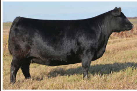
BLAIRS UPTOWN GIRL 105X