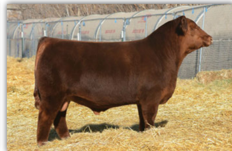
Blairs Kongo Maternal Brother to Lot 46