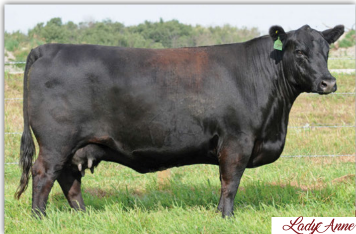
Lady Anne MVF Lady Anne 935S Reference Grand Dam of Lot 22