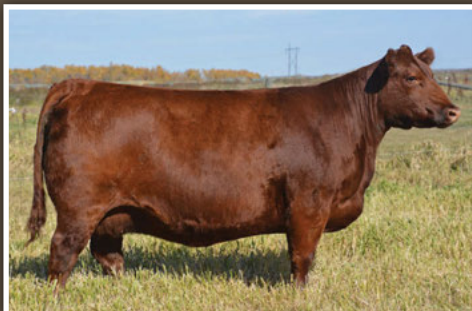
RX LADY NOLEN 114Y